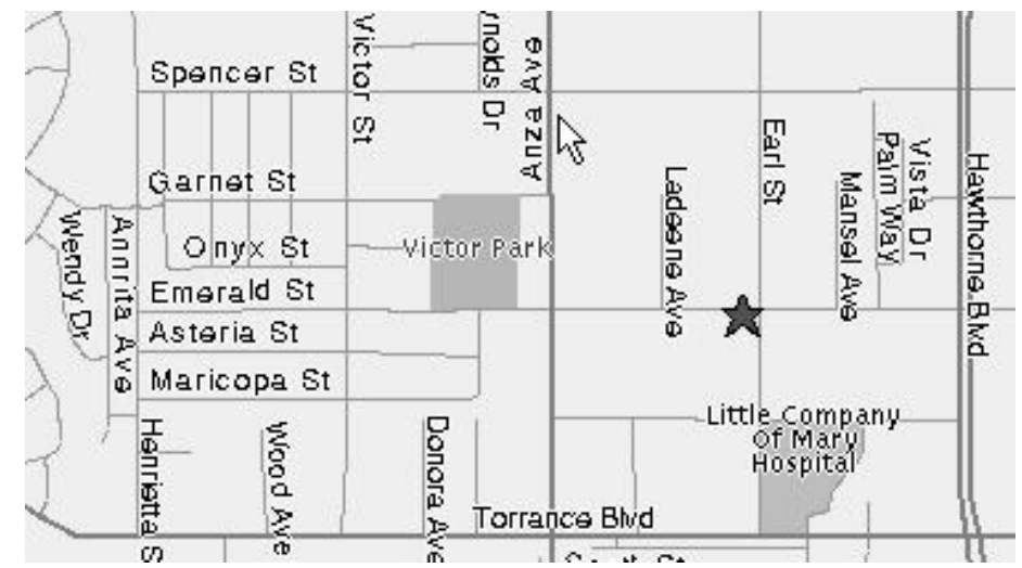
Salvation Army—4223 Emerald Street—Torrance